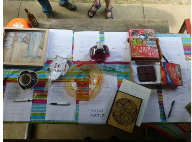
The silent auction really highlighted the talents and treasures of our community.

Thank you again for your support of our Polish-American community and attending this annual event.